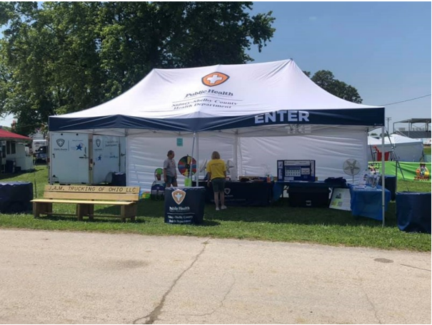
Picture of tent at Shelby County Fair July 2021

The Shelby County Healthcare Preparedness Coalition consisting of long term care facilities, home health agencies, and organizations that assist those that are elderly or have access and functional needs also continued to meet virtually to address the needs of those they service. SSCHD along with the Shelby County EMA distributed PPE resources to the hospital, healthcare workers, EMS/ Local Fire Departments, long term care facilities, and law enforcement. The SSCHD also distributed cloth and three ply masks, hand sanitizer and home test kits to the public. For those caring for individuals with COVID-19, care kits were distributed containing appropriate PPE resources, sanitizing wipes, hand sanitizer, thermometer, and pulse oximeter. The SSCHD also provided kits with medical supplies to each of the schools that contained thermometers, tissues, gloves, pulse oximeters, paper cups, and band aids.