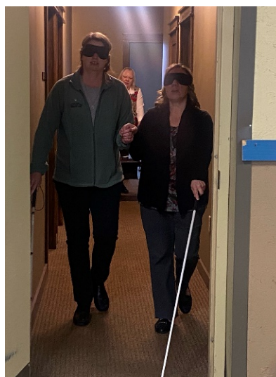
Think This is Easy Training