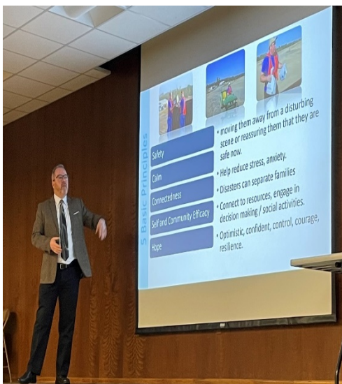
Psychological First Aid Training

Volunteer Recruitment activities occurred at the Shelby County Senior Center during the flu clinic on October 5 and the insurance and services fair on October 30. Additionally, this grant provides us the opportunity to create an informational video to promote our program and recruit new members. Filming of some content for this video will occur at the Stop the Bleed Training on February 12. If attending and interested in saying a sentence or two about your experience in the MRC program, please let us know. The best way to promote the MRC is for people to hear from our members.